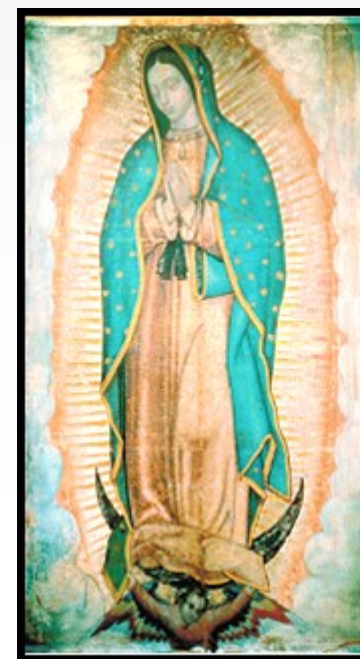
Relic Image of Our Lady of Guadalupe Located in the Mother of America Perpetual Eucharistic Adoration Chapel

The Marian Center for Peace is also privileged to be the caretaker for a set of traveling images of Our Lady of Guadalupe and the Divine Mercy. These images have been taken to pro-life events, Marian conferences, and Eucharistic processions.